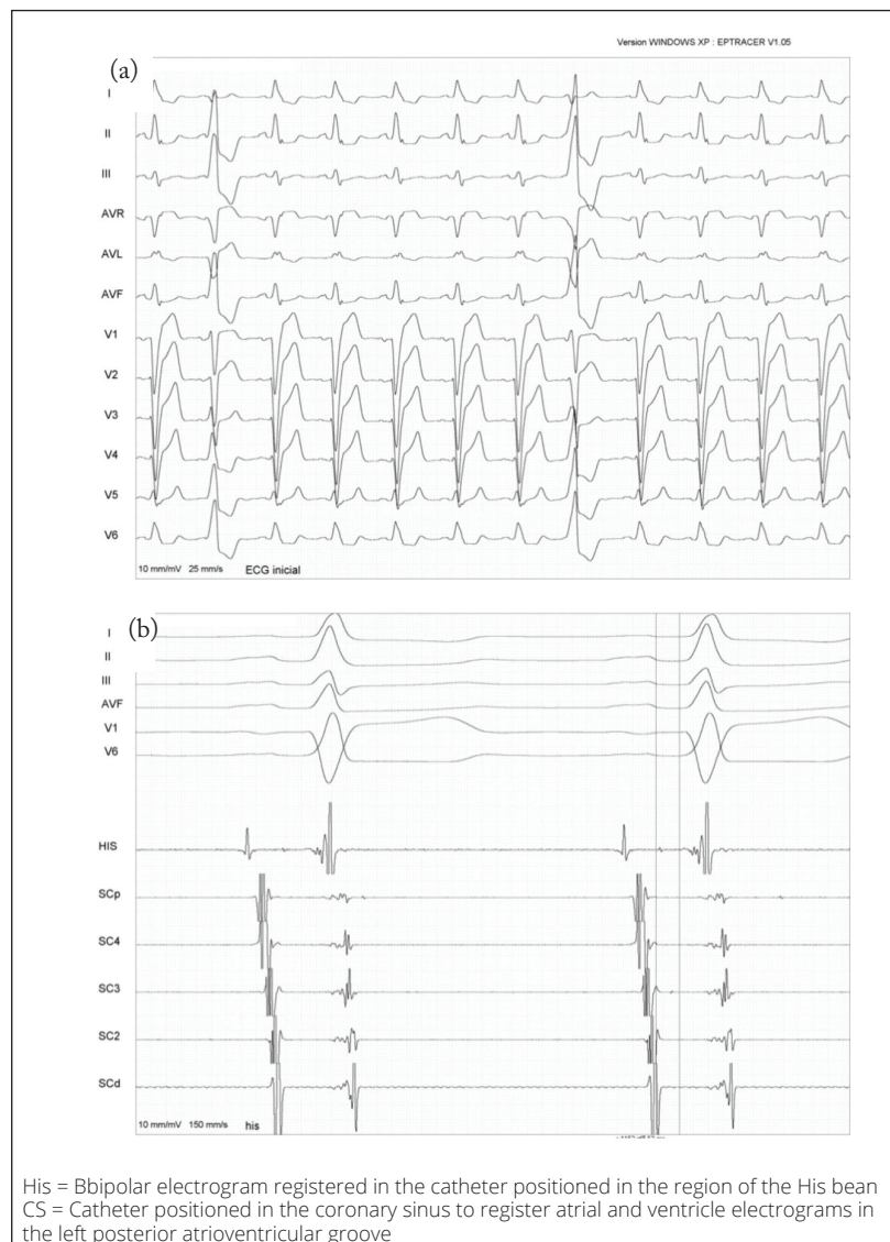
Figure 1. Electrocardiogram initial of sinus rhythm entry, LBB, and isolated ventricle extra-systoles. In the inferior image (b), it is possible to see the intracavitary entry of the His bean with HV interval of 50 ms.

Patient from male gender, 60 years of age, referred for ablation for symptomatic ventricular arrhythmia despite treatment with amiodarone. Patient with chronic dilated cardiomyopathy post-myocarditis with optimized therapy and functional class II. A previous electrophysiological study showed sinus rhythm with a pattern of left branch block (LBB) (QRS = 150 ms), an interval of 50 ms and absence of ventricular tachyarrhythmia Through ventricle extra-systoles (20% 24h Holter), the patient was submitted to ablation. The initial entry in the electrocardiogram (ECG) and the HV interval are shown in Fig. 1. During the screening, it was noticed the finding presented in Fig. 2. How is that explainable?