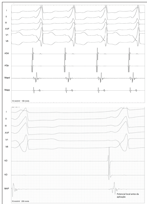
Figure 1. Local potential before application of cryoablation.

The Figs. 1 to 3 show the obtained results. Of the 13 patients, 11 had an acute success in eliminating the accessory pathway. One patient actually had multiple accessory pathways, one right side, and one left side. In this patient, it was possible only the ablation of the left pathway. In all others, it was observed exuberant Hisian potential at the point of application with success.